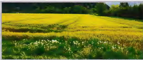
* No amount of fertilizer will correct