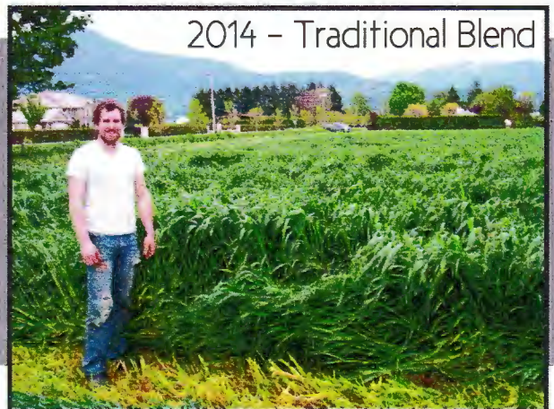
2014 - Traditional Blend

*Not recommended if you have an old mower