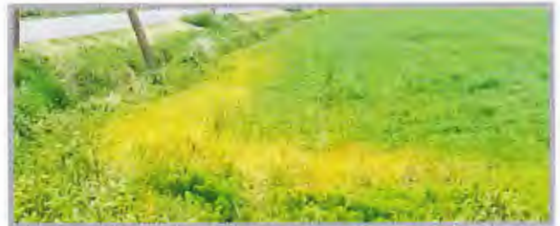
* Notice edge where no manure or fertilizer was applied